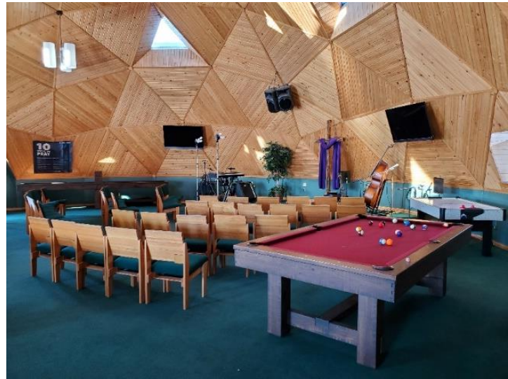
Dome Worship/Youth Space